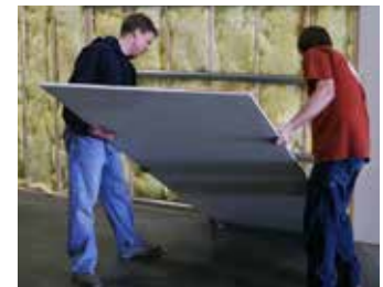
Step 3: Raise the drywall into place