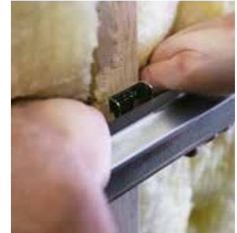
Step 2: Snap hat channel into clips

Scan QR code to see how to apply the Green Glue Noiseproofing Clip.