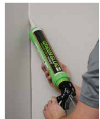
Step 4: Fill gaps between drywall

DISCLAIMER: Because of the many installation variables beyond our control, Green Glue Company shall not be liable for incidental and consequential damages, directly or indirectly sustained, nor for any loss caused by application of these goods not in accordance with current printed instructions or for other than the intended use. Our liability is expressly limited to replacement of defective goods. Any claims shall be deemed as waived unless made in writing to Green Glue Company within thirty (30) days from the date it was discovered, or reasonably should have been discovered.