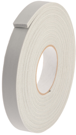
Figure 3. Norseal 520GF SNS Tape offers flame-retardant, closed cell F-20 Silicone Foam as the base material, along with a film-supported acrylic pressure-sensitive adhesive.