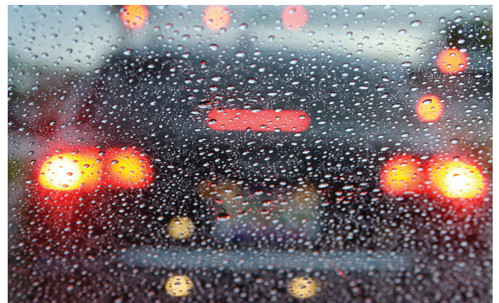
Figure 1. Moisture seeping in vehicle headliners via the center, high-mounted brake light is a common — but entirely preventable — complaint.

Rear-mounted lamps present several unique considerations relevant to determining an appropriate type of sealing material. Because the housings incorporate plastics — typically ABS