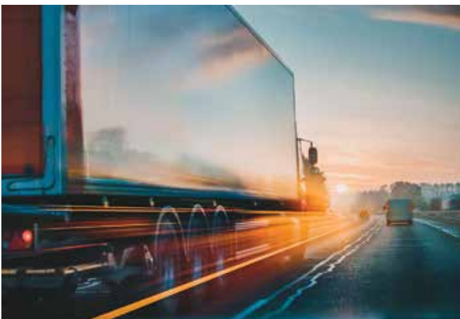
Figure 1: Tapes are used in numerous transportation applications.

In the past, these applications would have needed to be assembled using screws, clips or other fasteners, which caused other problems. For example, the use of mechanical fasteners increases part count and assembly time, increasing material, labor and tooling costs. It is also difficult for mechanical fasteners to make assemblies water-tight, leading to premature rusting and failure of the fasteners or connecting parts. Mechanical fasteners can also increase forces and stresses in the vicinity of the fastener, causing unsightly waviness and compromising aesthetic appearance.