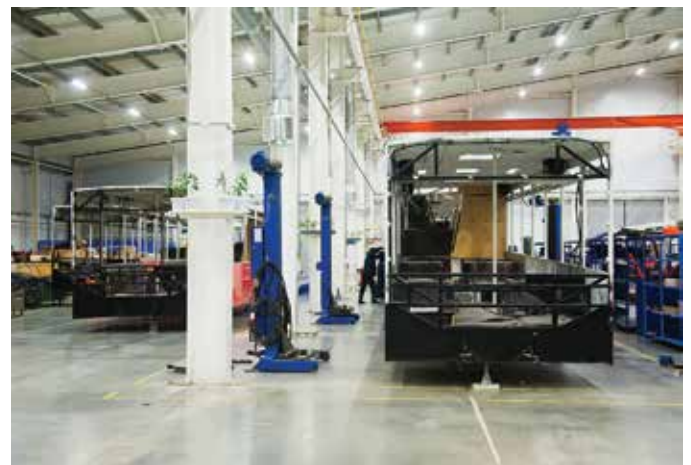
Figure 2: Tapes are increasingly replacing fasteners to secure trim, emblems, seals and more in commercial and specialty vehicles, like these buses.